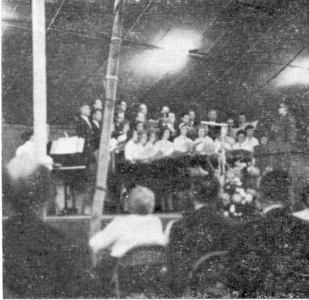
Combined Chicago-La Grange Chorale singing praises to God under The Big Tent.